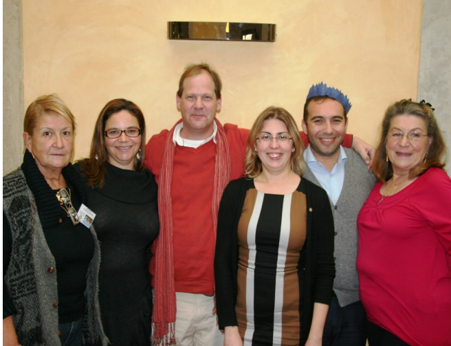
Members of the RCEPI Youth Service Committee

As a club we have been lucky in having a number of new, younger members which has allowed us to expand our interest to the younger community in our area.