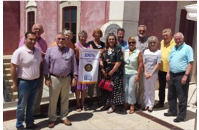
members of Estoi Palace Rotary with the awarded banner