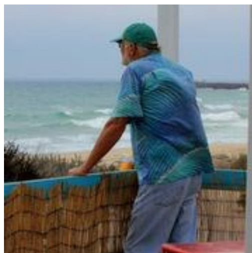
A ex sea captain looking wistfully out to sea

All lighthouses in Portugal are open to the public every